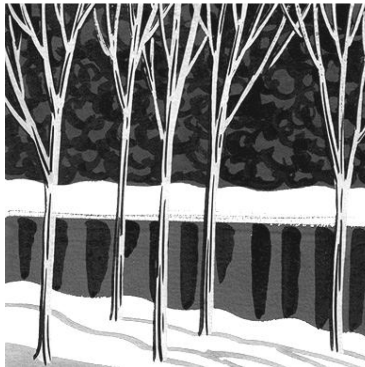
image credit: Canadian Scenes by Seth in The Walrus July/August 2010