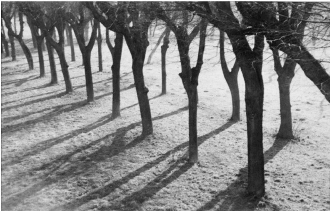
image credit: (top) from The Native Trees of Canada by Leanne Shapton (below) Trees by Josef Ehm